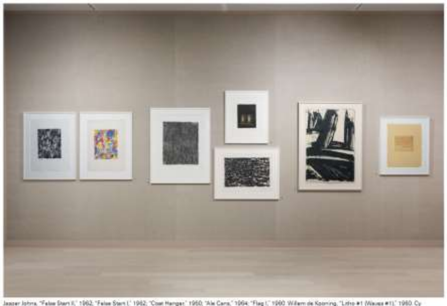
Japper Johns, Tellie Start 8, 1962; Tellie Start 1, 1962; Total Hanger, 1960; Tale Cana, 1964; Tlag 1, 1960; Willem de Kooning; "Litro #1 (Waluss #1), 1960. Cy Twombly, "Note 8, 1967