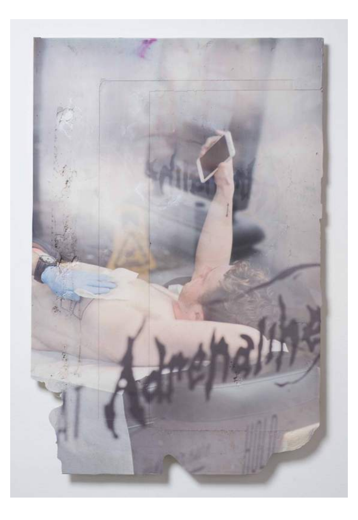
Josh Tonsfeldt, Adrenaline Tattoo , 2015.